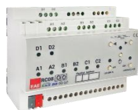
Room Control Unit